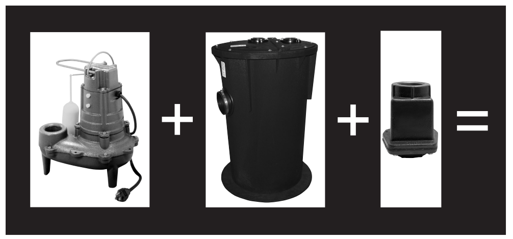
Model 10-1494 shown.

OPTIONS: Zoeller recommends a High Water Alarm for added protection. See FM0732 for available models