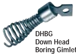
DHBG Down Head Boring Gimlet