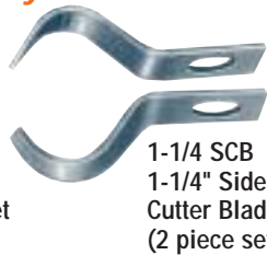
1-1/4 SCB 1-1/4" Side Cutter Blade (2 piece set)