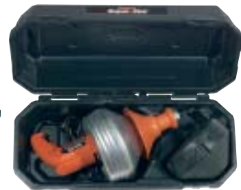
MCC Carrying Case