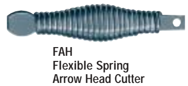
FAH Flexible Spring Arrow Head Cutter