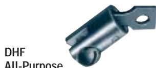
DHF All-Purpose Down Head Fitting Can be used with all standard HECS cutters.

CAA Closet Auger Attachment Guides 1/4" or 5/16" cable into bowl