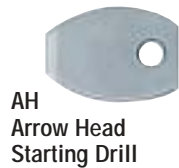
AH Arrow Head Starting Drill