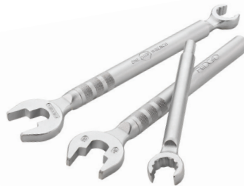
One Stop Wrench Catalog No. 27023