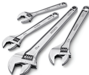
Adjustable Wrenches Catalog Nos. 86902, 86907, 86912, 86917, 86922, 86927, 86932