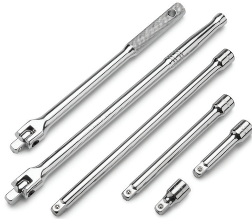
Optional accessories (not included): for use in place of T-Handle.