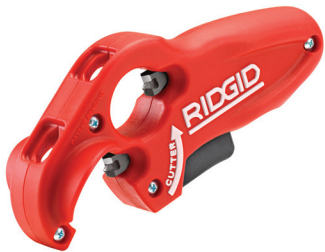
PTEC 3000 Catalog No. 41608