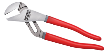
Tongue & Groove Pliers Catalog Nos. 62347, 62352, 16473, 62362