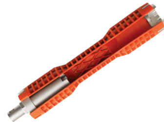
Faucet & Sink Installer Catalog No. 66807