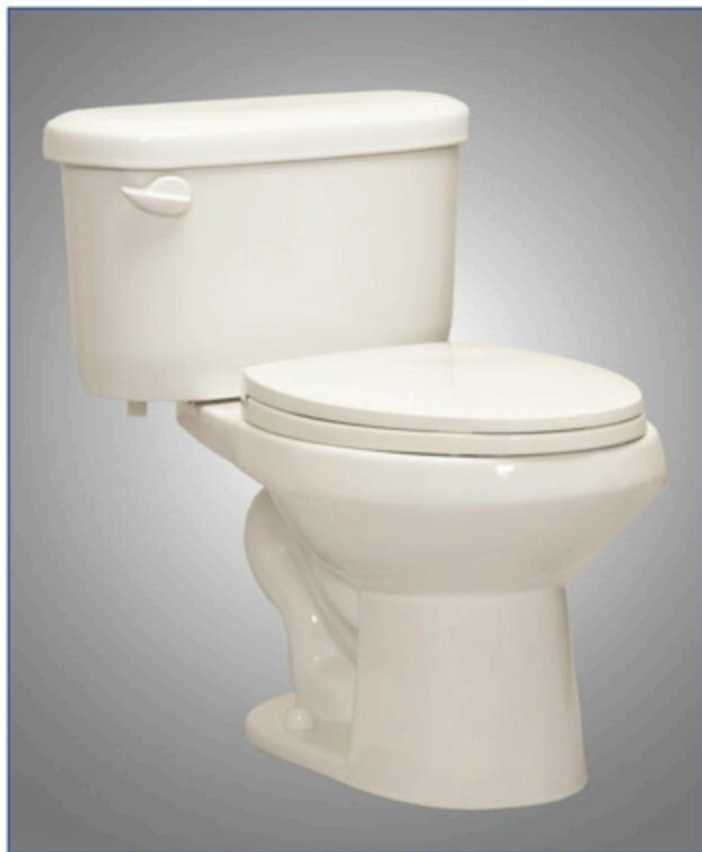
With Western the water savings are significant and maintenance is minimal.